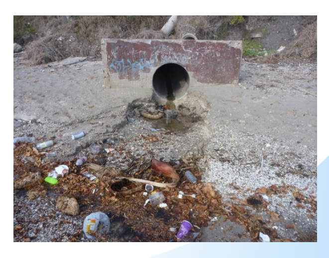
Ropes Park stormwater outfall