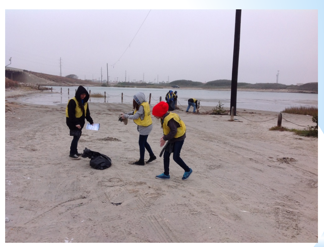
Volunteers at the winter 2014 Adopt A Beach Cleanup at the Mollie Beattie Habitat Community

CBBF is a public interest organization dedicated to the conservation of freshwater and coastal natural resources for current and future generations through consensus, facilitation, communication, advocacy, research and education.