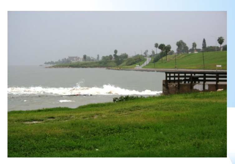
Cole Park stormwater outfall

Cole and Ropes Parks on the Corpus Christi Bay shoreline, Corpus Christi, Texas