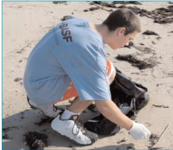
A volunteer at the Fall Beach Cleanup at Surfside.

Texas General Land Office Adopt-A-Beach Fall Cleanup was held in conjunction with the International Coastal Cleanup sponsored by the