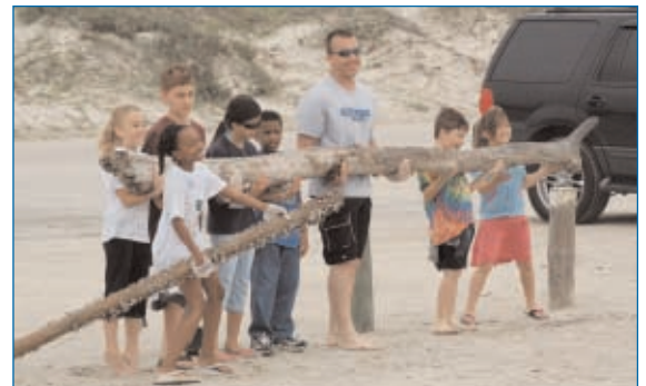
Volunteers in Port Aransas.

Volunteers are asked to wear closed-toe shoes, sunscreen, a hat and sunglasses and bring plenty of drinking water. Each cleanup site location will have trash bags and disposable gloves for the volunteers. In addition, participants will receive a souvenir