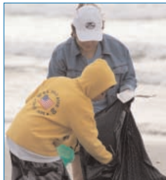
Last spring 6,812 volunteers braved the weather and picked up 143 tons of trash.

Mark your calendars for the 22nd annual Texas General Land Office Adopt-A-Beach Spring Cleanup set for Saturday, April 26th at 26 sites all along the Texas coast. From 9 a.m. to noon, volunteers will clean the beaches and bays from Beaumont to Boca Chica. Local Adopt-A-Beach Coordinators will check in volunteers that morning between 8:30 a.m. and 9 a.m. Large groups should pre-register prior to the event by contacting the local site coordinator. Contact information for each site location can be found on our Web site at www.texasadoptabeach.org .