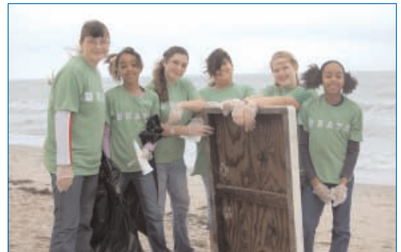
An environmental youth group pitches in at Corpus Christi Beach.

Many heartfelt thanks to our sponsors and Winter Texans for a job well done! Thanks for your help and we'll see you in February 2009.