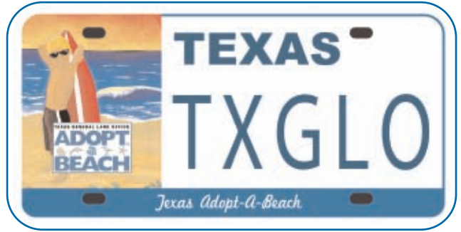
The new Texas Adopt-A-Beach Program specialty plates.

The plates should be ready for public distribution this summer. If you're interested, please e-mail your contact information (name, address, phone number and e-mail address) to beach@glo.state.tx.us so we can notify you when