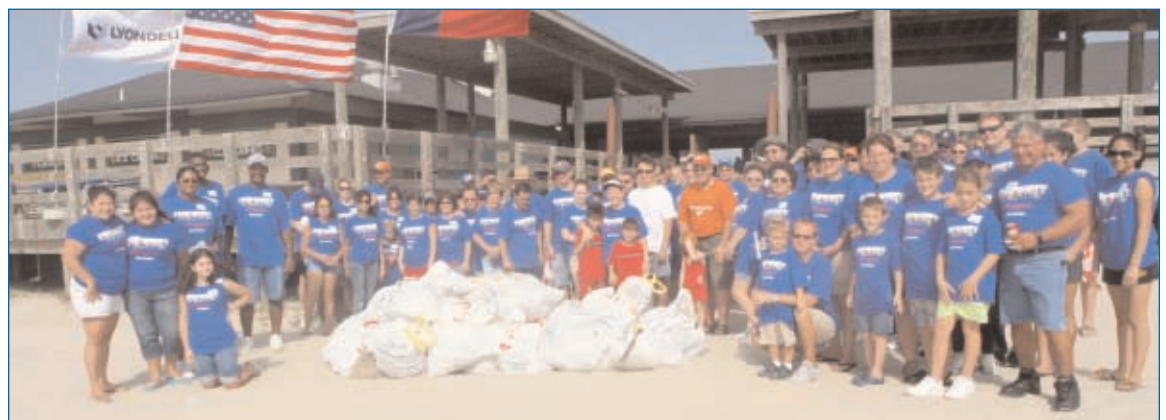
Lyondell Chemical Company volunteers at Matagorda Beach.

The success of the Adopt-A-Beach Program is made possible by the generous efforts of dedicated volunteers and the strong support of community leaders and sponsors across the state. Thanks again to all who helped make this cleanup a huge success! Please mark your calendars to join us for the 2008 Spring Cleanup set for Saturday, April 26, 2008 at sites all along the coast. 🌊