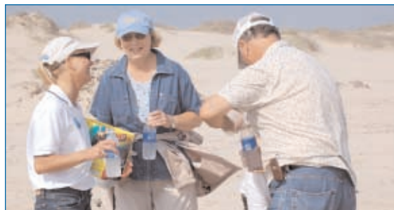
Winter Texans receiving much needed refreshments.

Winter Texans—often referred to as “snowbirds”—come to South Texas each year to enjoy mild temperatures during the winter months. Most snowbirds reside in travel trailers, while others rent condos or hotel rooms for an extended period during the winter months to avoid harsh temperatures and shoveling snow. Many enjoy activities such as fishing, golfing and square dancing, while others come here just to relax and enjoy South Texas’ beautiful beaches.