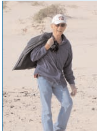
A Winter Texan.

The 11th Annual Texas General Land Office Adopt-A-Beach Winter Texan Cleanup took place at Edwin Atwood Park on Friday, February 15th at South Padre Island. Rio Grande Valley snowbirds, area students, and Beach Guardians at Isla Blanca Park enjoyed warm temperatures and plenty of sunshine while doing their part to keep our Texas beaches clean. The volunteers covered five miles of beach and removed 2.63 tons of trash from both the northern and southern ends of the island. Some of the more unusual items found this year were a full bottle of Budweiser beer, a $1 bill, plastic toy flags, underwear, a hypodermic needle, a Spiderman T-shirt, a Home Depot T-shirt from Mexico, a golf ball, a house key, a CD, and part of a cell phone.