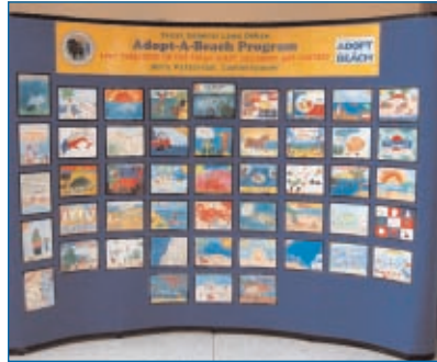
Winning entries from the 2007 contest were on display at the state Capitol.

The contest was open to all children who live in the state of Texas and who are in grades K-6. Ten winners were chosen from the following categories: Grades K, 1, and 2; Grades 3 and 4;