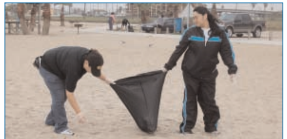
Volunteers at Corpus Christi Beach.

The 4th Annual Texas General Land Office Adopt-A-Beach Winter Cleanup took place at three sites in the Coastal Bend area on Saturday, February 16th. Sites participating in this year's event were Aransas